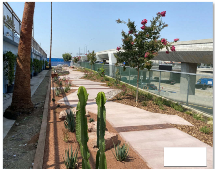
110/28 th Street, Los Angeles