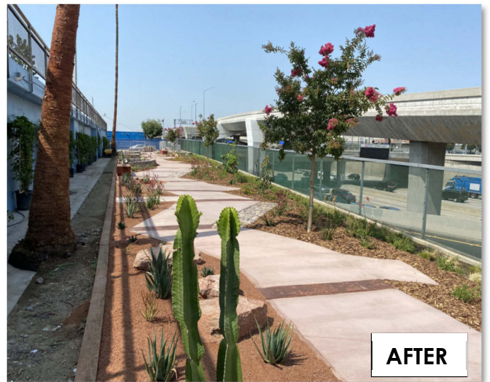
110/28 th Street, Los Angeles